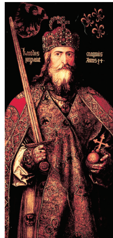
▲ Emperor Charlemagne

Charlemagne Leads a Revival Charlemagne strengthened his royal power by limiting the authority of the nobles. To govern his empire, he sent out royal agents. They made sure that the powerful landholders, called counts, governed their counties justly. Charlemagne regularly visited every part of his kingdom. He also kept a close watch on the management of his huge estates—the source of Carolingian wealth and power. One of his greatest accomplishments was the encouragement of learning. He surrounded himself with English, German, Italian, and Spanish scholars. For his many sons and daughters and other children at the court, Charlemagne opened a palace school. He also ordered monasteries to open schools to train future monks and priests. B